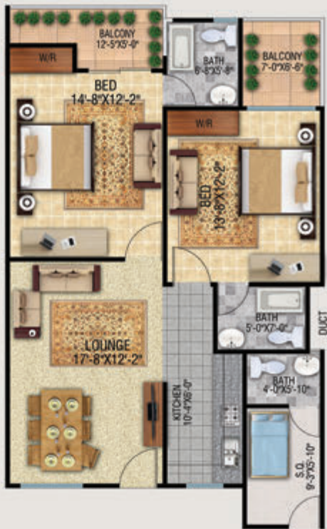
Type B Size: 1450 SqFt