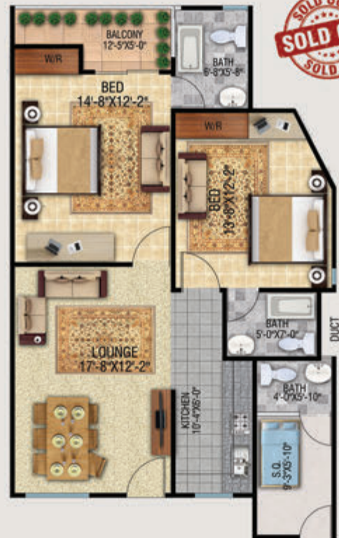
Type B-1 Size: 1370 SqFt