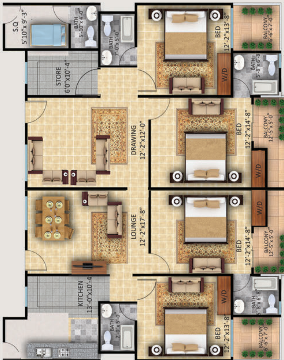
4 Bedroom Apartment Size: 2900 SqFt

Bedrooms 4 (attached Washrooms & Balcony) Lounge 1, Drawing 1, Kitchen 1 , Store 1 Servent Room 1, Parking 2.