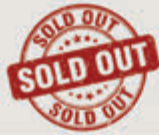
Type A Size: 2150 SqFt